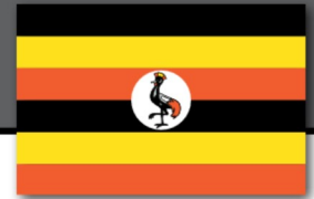
Figure 1: Energy profile of Uganda