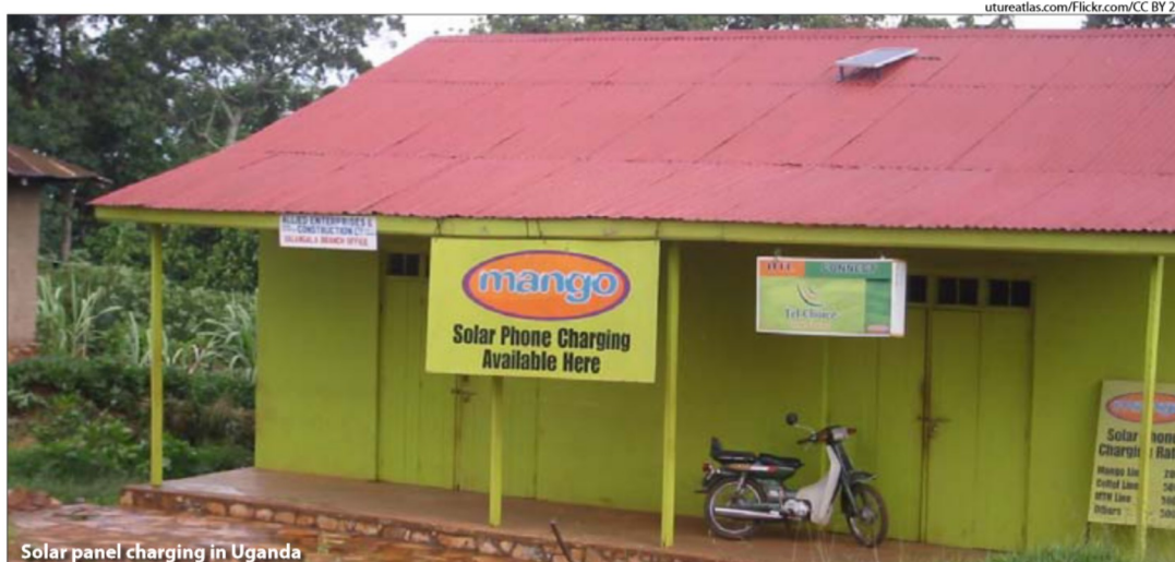
Solar panel charging in Uganda